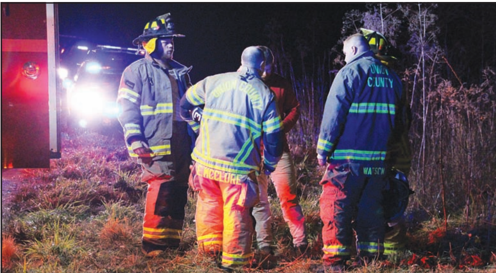
Union County firefighters near the scene of the Kings Road plane crash.