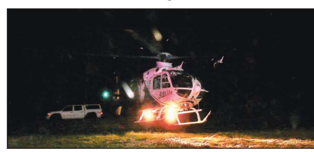
Air Life Georgia life-flighted the lone survivor of the Dec. 19 plane crash off Kings Road near the Blairsville Municipal Airport.

will also be looking to establish a history of the flight, including "where they were going, when they were going, where were they coming from, etc.," according to Weiss. All told, the investigation